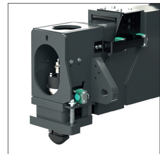
Twistlock and lifting eye.

All specifications are subject to change without notice. A list of options enables you to adapt the product more precisely to your needs and further information is available on request.