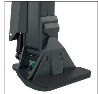
Piggyback foot, North American Standard.