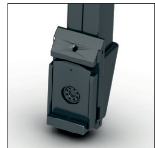
Grapple leg foot, European standard.

All specifications are subject to change without notice. A list of options enables you to adapt the product more precisely to your needs and further information is available on request.